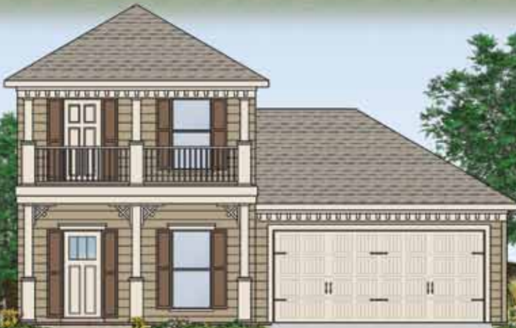
Lap Siding Style*