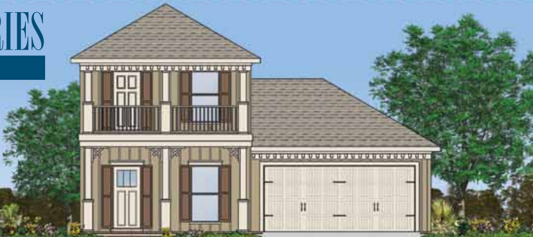
Board and Batten Style*