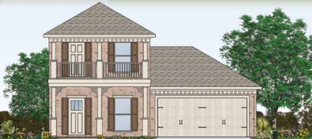
Traditional Brick Style*